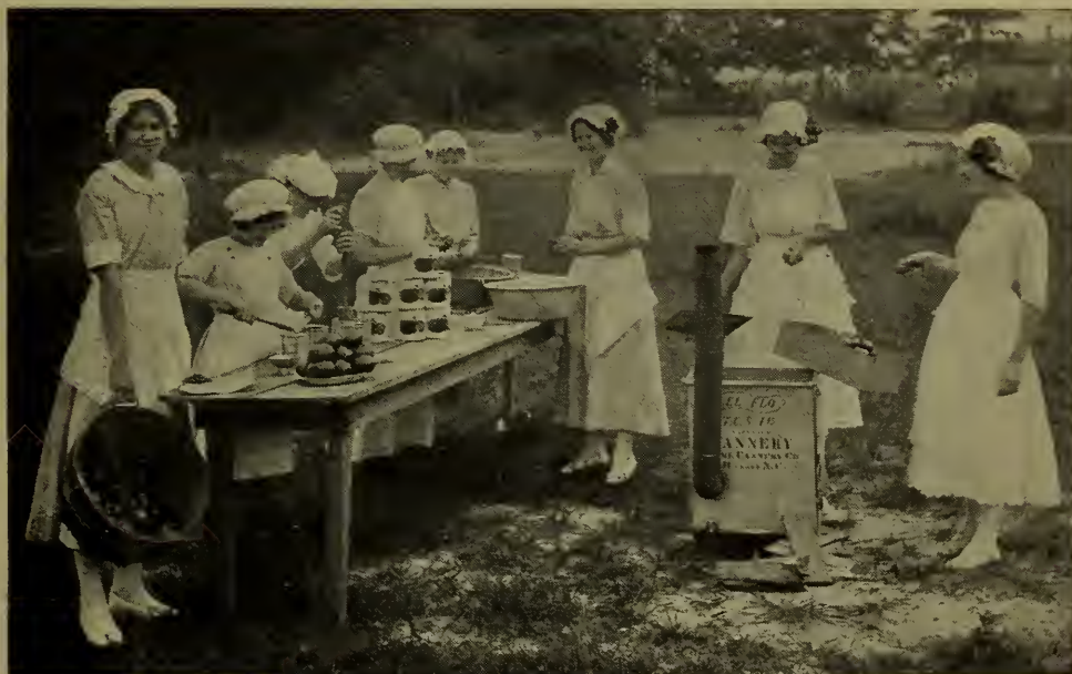
A GIRLS' TOMATO CLUB IN SESSION.

The rural school supervisor of a North Carolina county encouraged the pupils and teachers to cultivate cotton in the waste ground round the schools. In one year the pupils of the county cleared from this source six thousand dollars, which was used for school improvement.